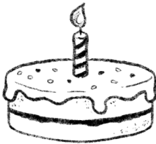
Someone born in the same month as you