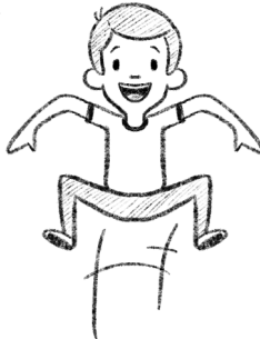
Someone who can jump high